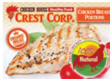
Food and beverage label